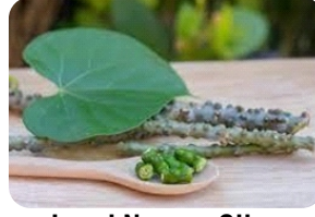
Local Name : Giloy