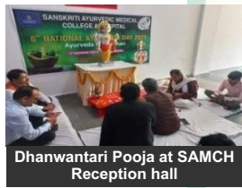
Dhanwantari Pooja at SAMCH Reception hall

Poshanam or nutrition plays an important role in Ayurveda. Nutrition, the process of nourishing or being nourished includes ingestion, absorption, assimilation, biosynthesis, catabolism and excretion. Ayurveda emphasizes on matra, kaala, vidhi of Ahara or Anna from baalyavastha to vardhakyavastha & also the relevance of Agni to digest the Ahara. On account of the 6th National Ayurveda Day 2021 which falls on auspicious Dhanwantari Jayanti, SAMCH organised three events – Dhanwantari Pooja to seek blessings from Lord Dhanwantari, the God of healing and medicine at SAMCH reception hall, two fruitful session of webinar on topic related to Ahara on 2nd November 2021 and Ayurvedic food festival for nutrition of children on 31st October 2021. The first session of the webinar